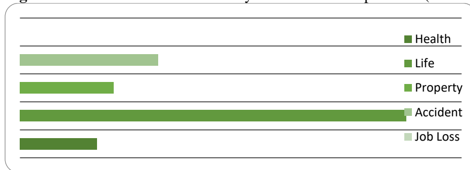
Figure 2: SUPPLY: Lives covered by micro insurance products (in millions)