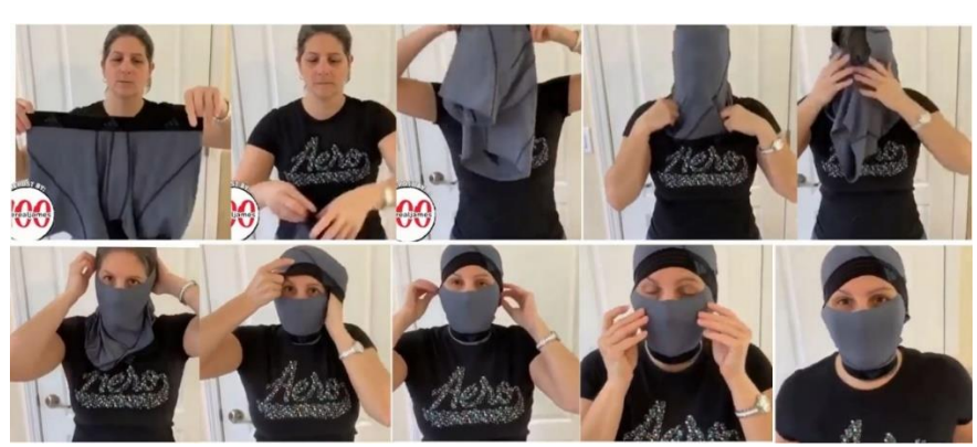
Fig.6: "No Mask? Do This" Slides from video clip