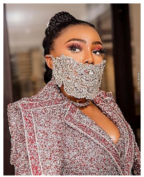
Fig. 4: The Aso Ebi Jumpsuit with a Face Mask

Art Nouveau (meaning New Art), also known as Jugendstil, Stile Liberty, Modernismo and Modern Style, is popular with the decorative arts and architecture (LeBourdais, 2016; Gontar, 2006). It revolves around the skilful marriage of art and craft (National Gallery of Art, 2000: 5-6; Madsen, 2013). It is evident in Figures 4 and 5 that the elaborate design work and masks are tailored towards fashion, with little regards for effective virus protection. The heavy craft work with stones on Figure 4 will not allow the mask to cover the nose because of weight. Figure 5 is, however, a total wear with the headgear extended to shield the mouth and nose. The elaborateness are reminiscent of the highly decorative style of many art genres, furniture and architecture associated with the style. Alphonse Mucha (1860-1939), Gustav Klimt (1862-1918), Antoni Gaudi (1852-1926), Victor Horta (1861-1947) and Louis Majorelie (1859-1926) are a few of the participants that easily come to mind. It is apparent that the two portraits are showcasing a likely fashion trend in this mood in the coming fairs.