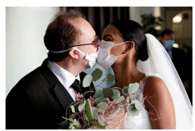
Figure 21: Couple "kiss through protective face masks during their wedding ceremony in Italy"