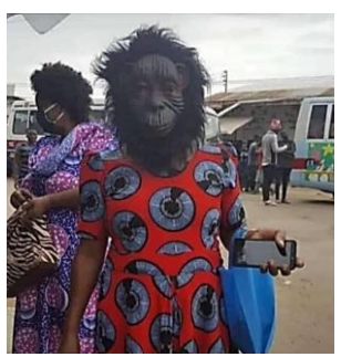
Fig. 18: A Lady with Gorilla Mask

with believe in its efficaciousness. The beauty of the mask type in Figure 19 is the creative way the cusps and the ends of the masks were done, a native ingenuity.