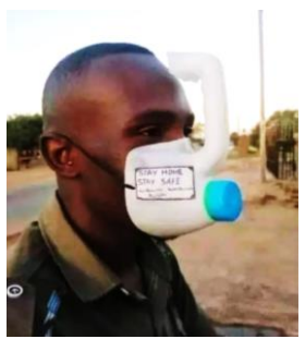
Fig. 12: Man with plastic cut to form a face mask