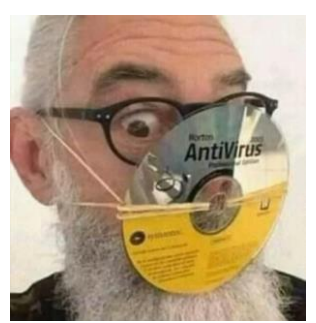
Fig. 8: Norton Antivirus CD face mask