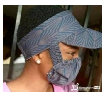
Fig. 23: Fashionable face mask combined with fez cap

It is worthy of note that many citizens that make dresses during this pandemic period never forget to instruct their dress makers to produce masks with the leftovers. Masking has rapidly turned the greatest necessity and fashion of the year. Even a few fashion-conscious people go to the length of making designer's face masks. Whether they are sufficiently protective or not is secondary. Aesthetics and fashion display are primary; for the female, beauty has shifted from bodily form to bodily accessories. For some reasonably health-conscious ladies, it is: No lipsticks, please! This visual experience of human physicality will be with us for the next few months as an unforgettable historical and artistic event.