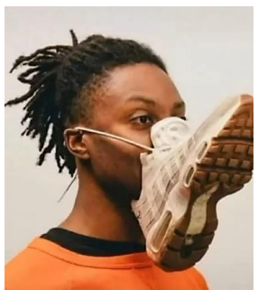
Fig. 11: How to survive a deadly global virus

Most of the portraits studied are very expressive of the feeling of the sitter or stander. But when reality is intentionally distorted in order to satisfy an inner feeling or craving, then the artist or person tends towards Expressionism (De La Croix, Tansey & Kirkpatrick, 1991: 968-974; Tate , n.d.[2]). Figures 12 and 13 are expressionistic. Even though there are several 3D types of face mask, Figures 12 and 13 evolve from maskers' personal convictions and the researcher's judgment of the masks' creativity. The stylistic formulae are also unique in material, hue and expressivity—Figure 12 is a polymer product and monochromatic, the other (Figure 13) is paper and metal, and polychromatic—though they are both 3 dimensional, with the same contextual and formal values.